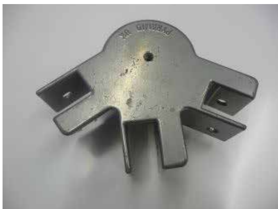
Top Leg Bracket from 6M Hex Model