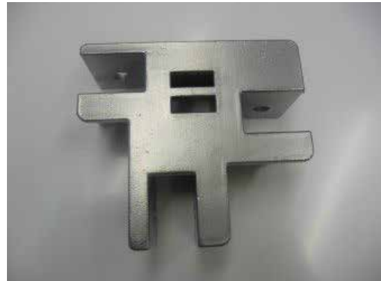
Cross Bar Joining Bracket