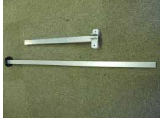
Upper & Lower Mast Poles