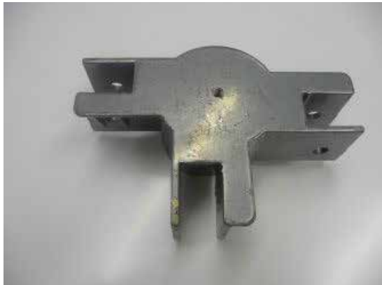
Top Bracket from Middle Leg on a 3M x 6m