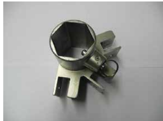
Sliding Leg Bracket form 6M Xeh Model