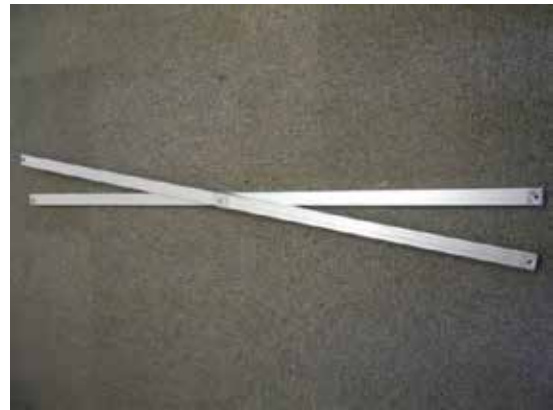
Cross Bar Pair