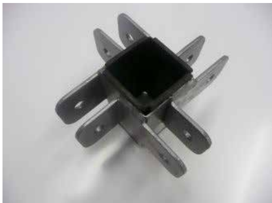
Sliding Mast Bracket