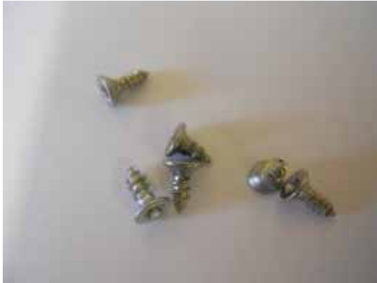
10 Grub Screws