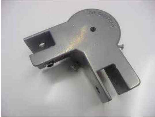
Top Corner Bracket