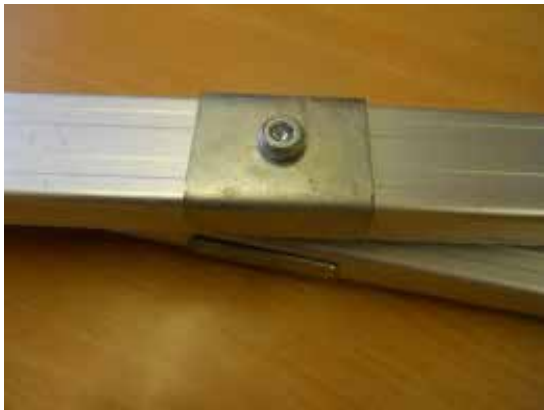
Cross Bar Saddle and Bolt