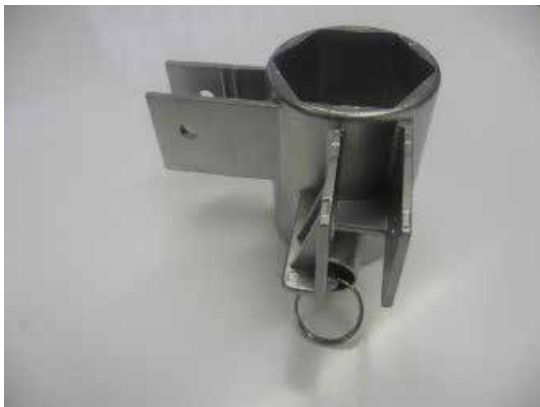
Corner Pull Pin Bracket