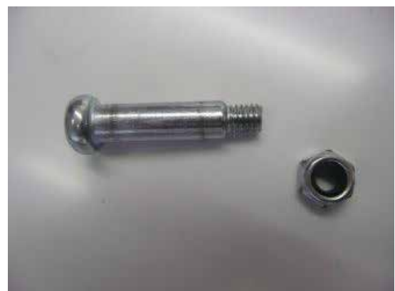
35mm Nylock Nut and Bolt