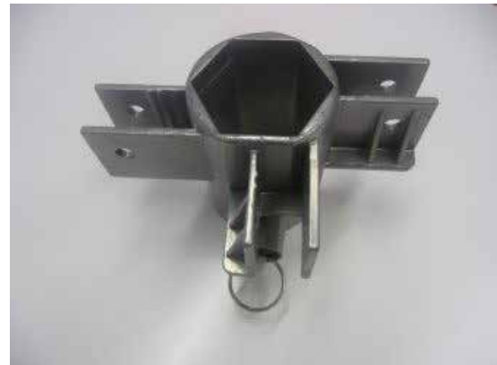
Sliding Middle Leg Bracket from a 3M x 6m