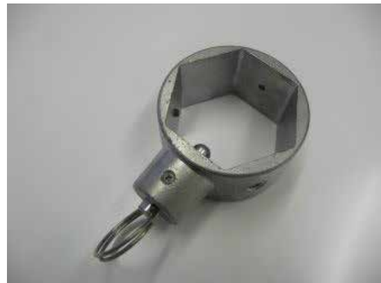
Collar and Pin